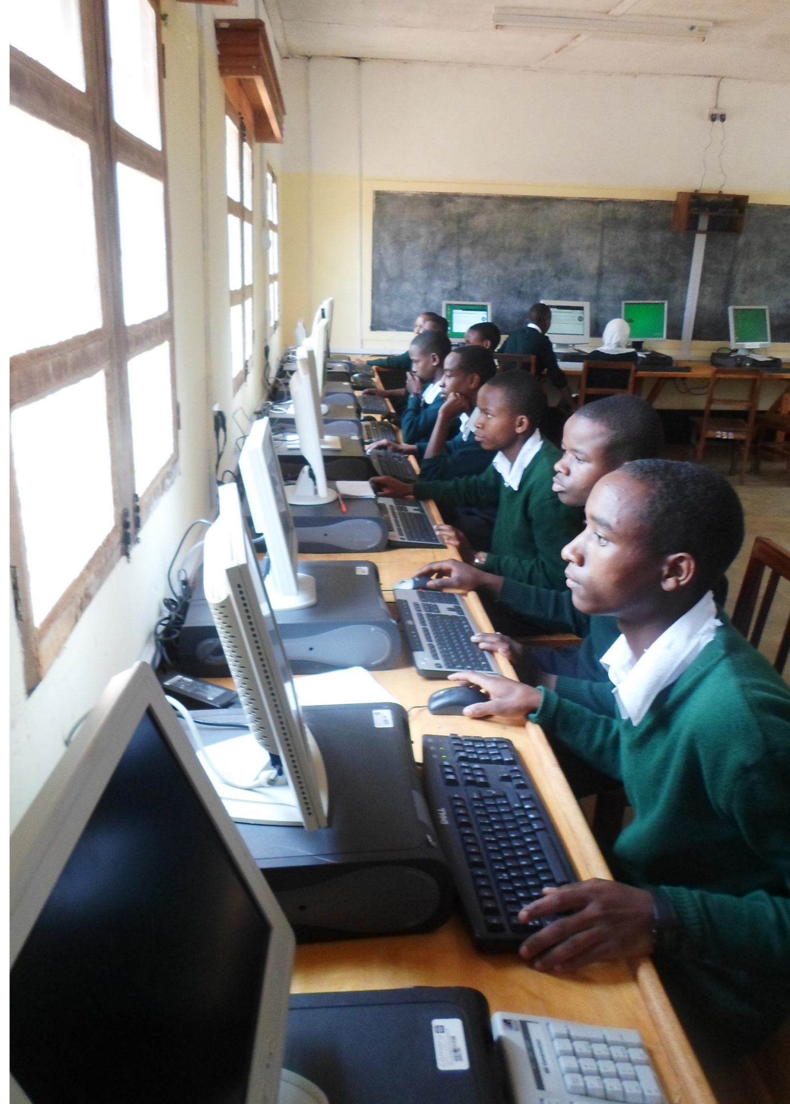
right: Students from Endasak Secondary School have benefited greatly from Porticus's sponsorship of the school's e-Learning Centre

Lack of adequate funding has hindered the use of computers at some of the schools. Whilst the physical infrastructure is in place, schools do not always have the means to pay for electricity in order to make full use of the installed labs. This compromises the value of these installations. Camara is actively speaking with schools where this has been identified as a problem to work around the issue.