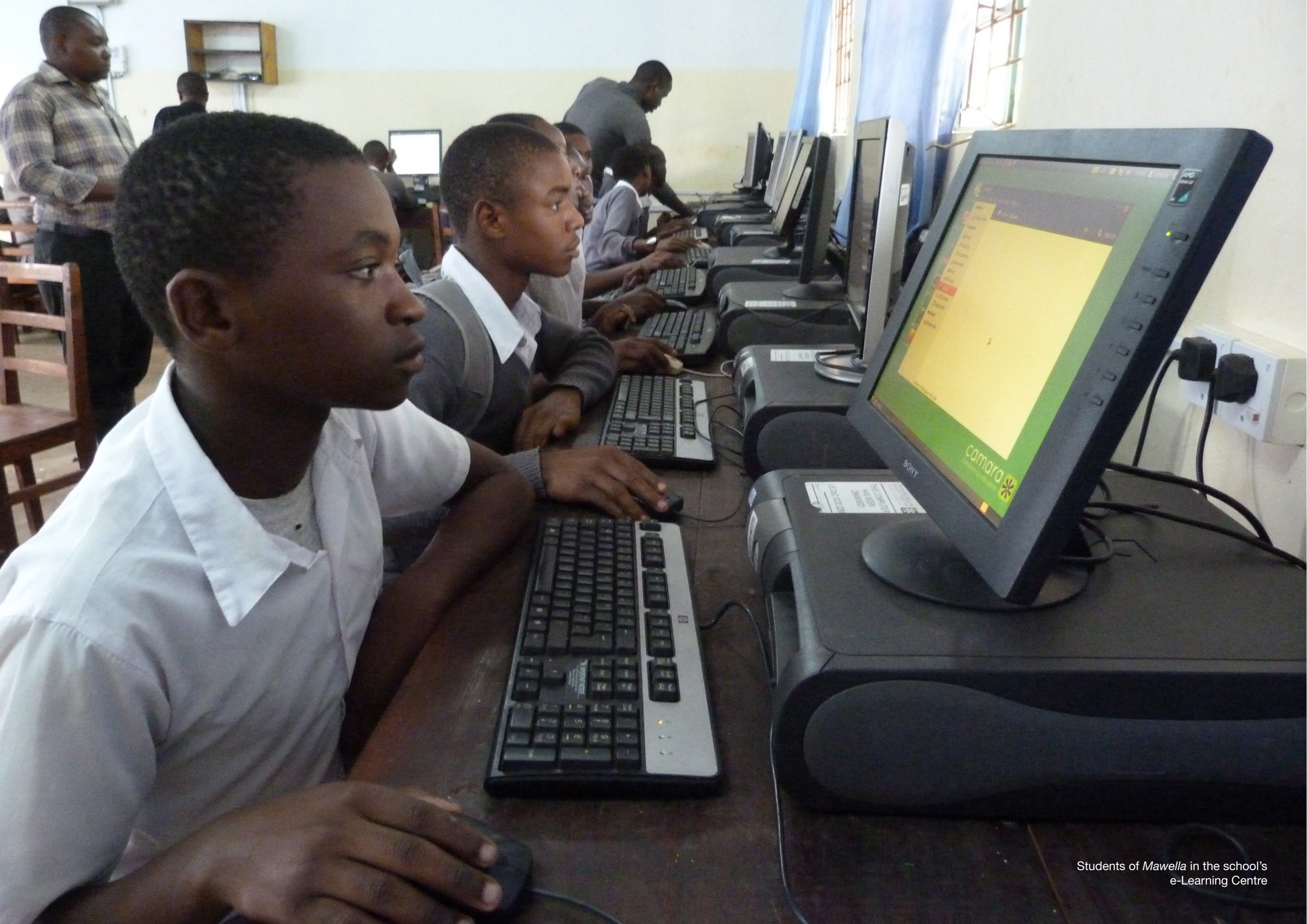
Students of Mawella in the school's e-Learning Centre